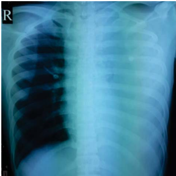
Figure 1. Chest X-ray homogenous opacity in left hemithorax

Chest x-ray examination was taken which showed a left total consolidation (Figure 1). CT scan thorax