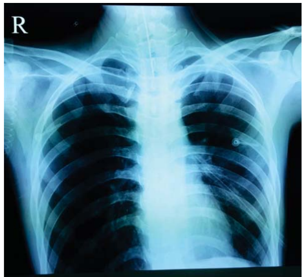
Figure 5. Chest X-ray after WSD

showed air-fluid level with left hemithorax pleural effusion, suspect left massive empyema (Figure 2). ECG showed sinus tachycardia. USG abdomen revealed solitary abscess in left quadrant size 18mm x 17mm.