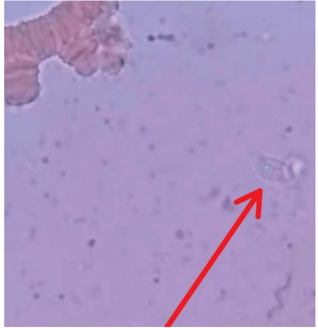
Figure 4. Microscopic view of Entamoeba histolytica