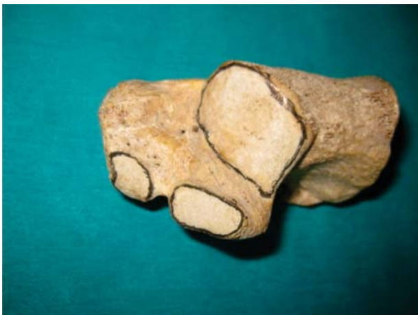
Figure 2 — Type II articular facet on the superior aspect of the calcaneus