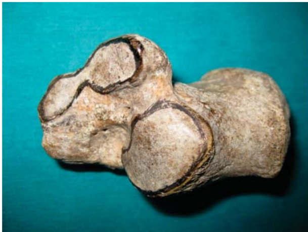
Figure 1 — Type I articular facet on the superior aspect of the calcaneus

I. Superior edge of anterior process to superior edge of posterior facet.