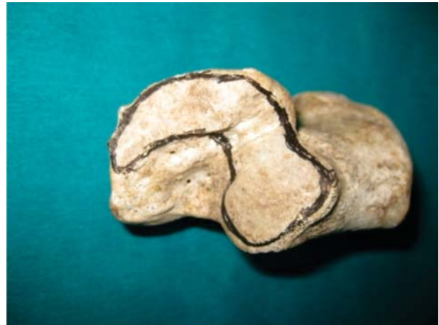
Figure 3 — Type IV articular facet on the superior aspect of the calcaneus