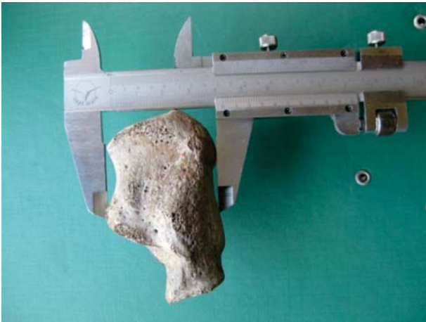
Figure 4 (c) — Measuring maximum vertical length of the calcaneus