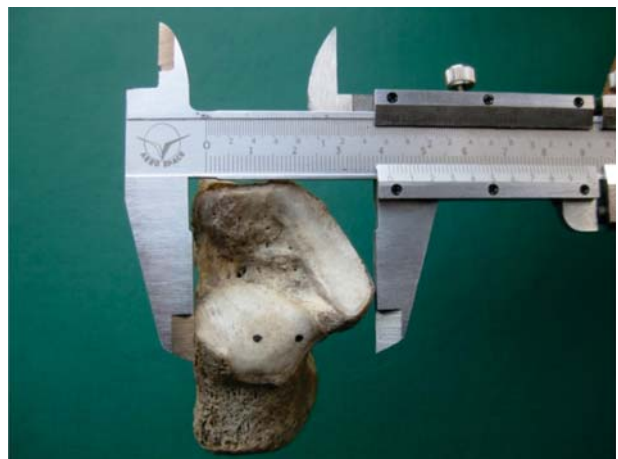
Figure 4 (b) — Measuring maximum transverse diameter of the calcaneus

II. Superior edge of tuberosity to superior edge of posterior facet.