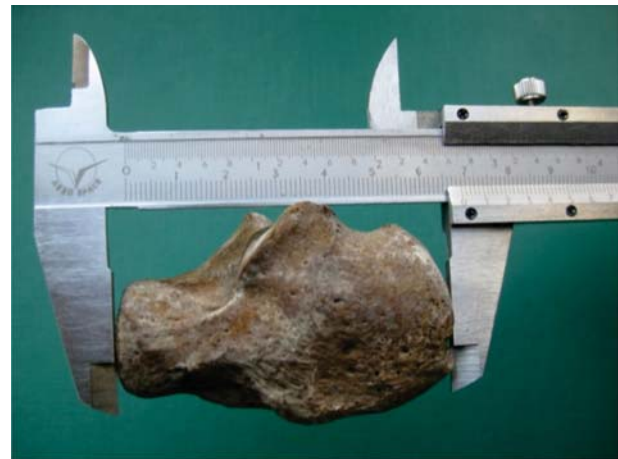
Figure 4(a) — Measuring maximum anterior posterior length of the calcaneus