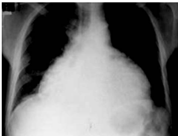
Figure 2. Preoperative chest X-ray

hough pericardiocentesis was applied again pericardial effusion was detected and drainage was planned. 1250 cc exudative fluid was drained from pericardium via subxiphoid incision under general anesthesia. Pericardioperitoneal window was created with approximately 6 cm of diameter (Figure 2). Malign cells were detected in pericardial fluid. There was no reproduction in the culture. The result of pericardium biopsy was adenocarcinoma. Patient was relieved in post-operative period. Tamponade did not recur in 6 months follow-up period.