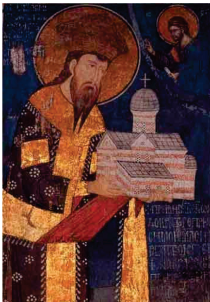
Figure 1. St. King Stefan of Decani; Original source: The fresco in Decani Monastery, Stefan with church model, in 14 th century

ful force in Balkan. His military force won at Velbuzd in 1330th, so Serbian Orthodox Church canonized him as a holy king. Monestary Decani, under Prokletija was the Stefan's foundation (Figure 1).