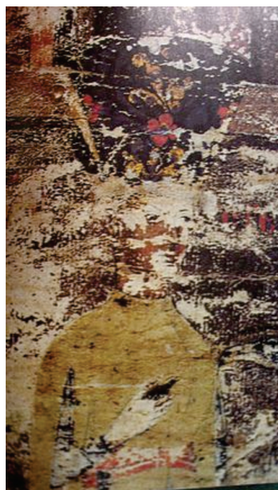
Figure 2. Righteous Blind Stefan, St. Serbian Despot Branković; Original source: The fresco of the young Stefan Esfigmenske Charter, in 1429

St. Stefan Branković was righteous descendant of the glorious Serbian Prince Lazar, of the Great Kosovo. Lazar and Milica had the oldest daughter Mara, who married for Serbian nobles, Vuk Brankovic. Vuk and Mara had three sons: Grgur, Djuradj and Lazar. After the death of Lazar and Milica, their son Stefan High (from 1389 until 1427) married the Greek princess Irina (Jelena) Paleologovom of Thessaloniki. Djuradj and Jelena had many children and among them was born the Blessed Stefan (about 1417 years). In his childhood, Stefan was blessed in every good mannered: he gained a great intellect and piety, obedience to parents, so that faith, wisdom and courage of many overcame, and its natural physical beauty. But the most important features Blessed Stefan lied in his commitment to the will of God, pure life and fidelity to the Church and the Orthodox faith. When the Turks attacked the capital of Smederevo, Grgur was captured and taken to Adrianople, where they were, on the orders of the Sultan Murat, and without knowledge of sister Sultana Mara, cruel both blinded by the Turks, on Easter Sunday in 1441. The one of the main reasons for this blindness of Serbian nobles was turkey envy, for their beauty and chivalry and fear that they did not become